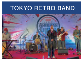
TOKYO RETRO BAND

Fri, April 24: 5:30 PM / 7:20 PM Sat, April 25: 1:00 PM / 3:00 PM / 5:30 PM / 7:20 PM Sun, April 26: 1:00 PM / 3:00 PM / 5:00 PM / 7:00 PM